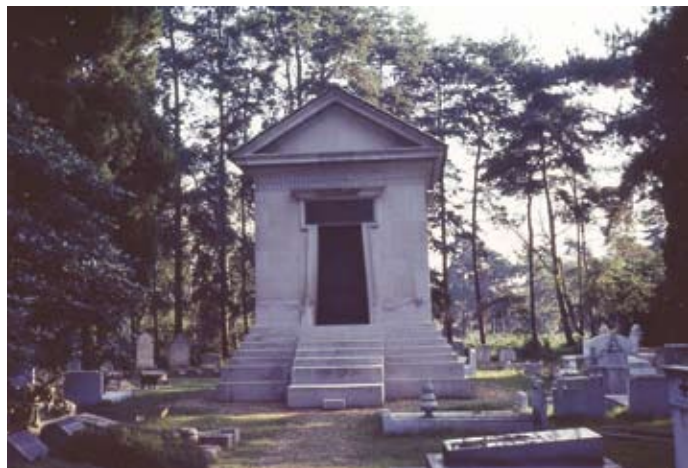
Wadia mausoleum at Brookwood Cemetery

travel and cultural contacts. One of the first steps taken by our Association in 1863 was the acquisition of an exclusive burial ground for Zoroastrians at Brookwood Cemetery in Surrey. Since 1863, our cemetery grounds at Brookwood remain in the service to our community to this day. Indeed, one of the important objectives contained in the Memorandum and Articles of our present Association is the provision of a burial ground for persons of the Zoroastrian faith, and the upkeep and maintenance of such grounds.