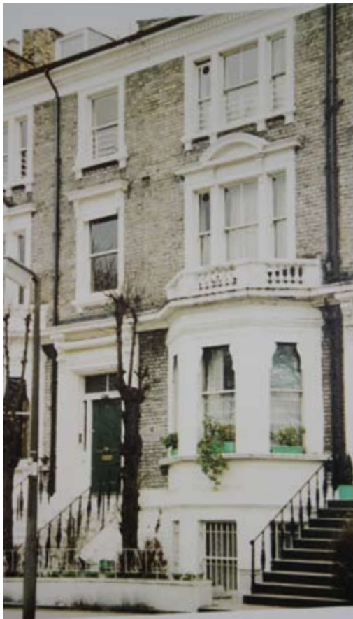
The Zoroastrian House at 11 Russell Road, Kensington. Purchased in 1929 - Sold in 1968