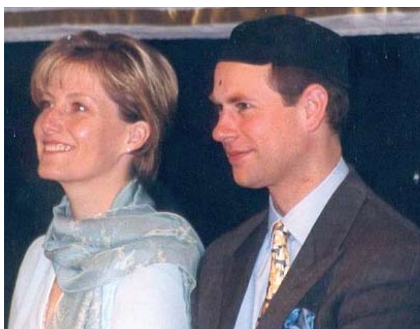
Prince Edward and Sophie Countess of Wessex at the Zoroastrian service to mark the Golden Jubilee of Her Majesty The Queen at The Zoroastrian Centre

an outward looking Organisation. Zoroastrians are now formally represented at national and international levels. Since 1994, our Presidents and officials have formally met Her Majesty The Queen along with other members of the Royal Family, quite regularly, that has included being invited to Buckingham Palace.