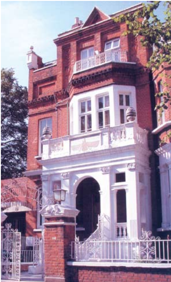
The Zoroastrian House at 88, Compayne Gardens, West Hampstead, London NW6 3RU Purchased 1969 - Sold 2004