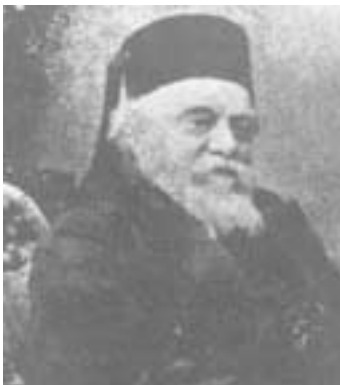
Ardeshirji Khurshedji Wadia JP FRS

Our Association was established when there were only around 50 Zoroastrians in the United Kingdom. The famous ship builder and engineer Ardeshirji Khurshedji Wadia JP FRS, who in 1841 was the first Indian to be admitted into the fellowship of the Royal Society, was one of the