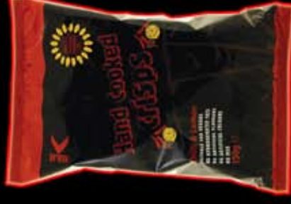
Kolak Hand Cooked