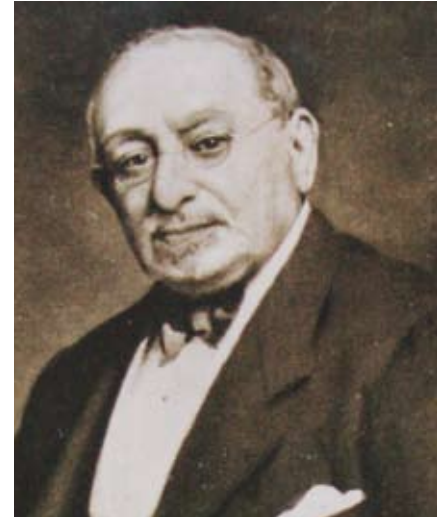
Sir Mancherjee Merwanjee Bhownagree KCIE MP 1895 - 1905

We are proud of the fact that the first three Asian Members elected to the United Kingdom Parliament were all members and patrons of our Association. The first ever Asian Member of Parliament was one of our earliest patrons and founder Dr Dadabhai Naoroji, elected to the House of Commons in 1892 to represent the constituency of Central Finsbury for the Liberal Party and he remained a Member of Parliament till 1895. Dr Dadabhai Naoroji was also the Association’s Second President from 1863 to 1908. The second Asian Member of Parliament was Sir Mancherjee Merwanjee Bhownagree