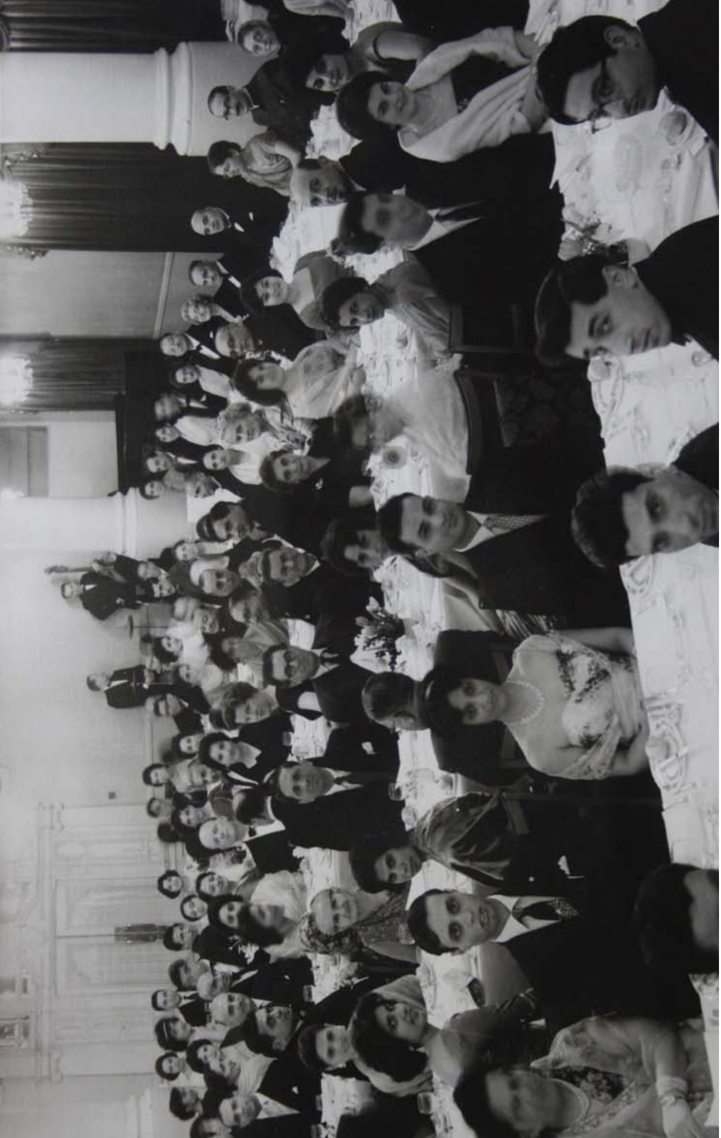
Jamshedji Navroze Banquet 21st March 1960 at St Ermin's Hotel, St James's Park, London