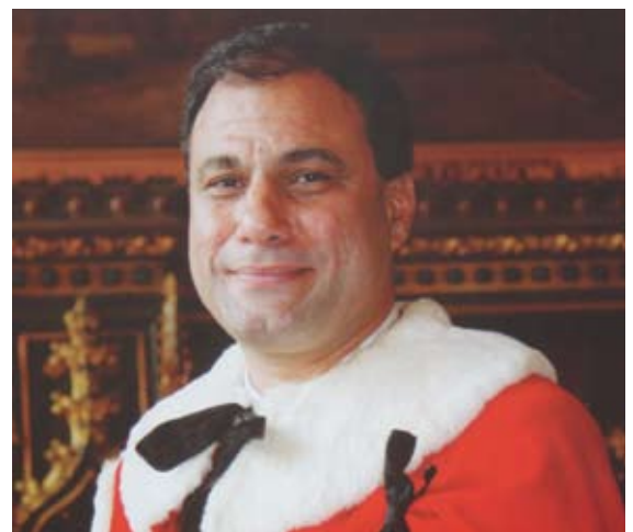
Lord Karan Bilimoria of Chelsea CBE, DL

Right Honourable Lord Karan F Bilimoria of Chelsea, DL, CBE, sitting in the Upper House of the British Parliament as a Cross Bencher. Lord Bilimoria ceremonially joined the House of Lords on 24th July 2006 is also Chairman of the Commonwealth Memorial Gates in Constitution Hill and several other Institutions.