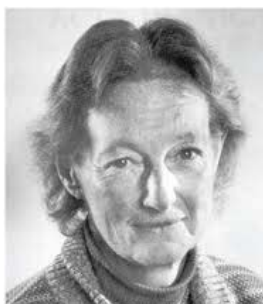
Professor Mary Boyce