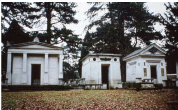
Tata mausoleums at Brookwood Cemetery

Another of the earliest Patrons and founder of our Association was Dr. Dadabhai Naoroji, one of the outstanding figures in the political history of India who in 1892 was the first Indian to be elected as a Member of Parliament in the United Kingdom. The elders of those early pioneering days must have visualised a growing community of Zoroastrians settling down in the U.K. for reasons of commerce, education, professional pursuit, government and Indian Civil Service, medical treatment,