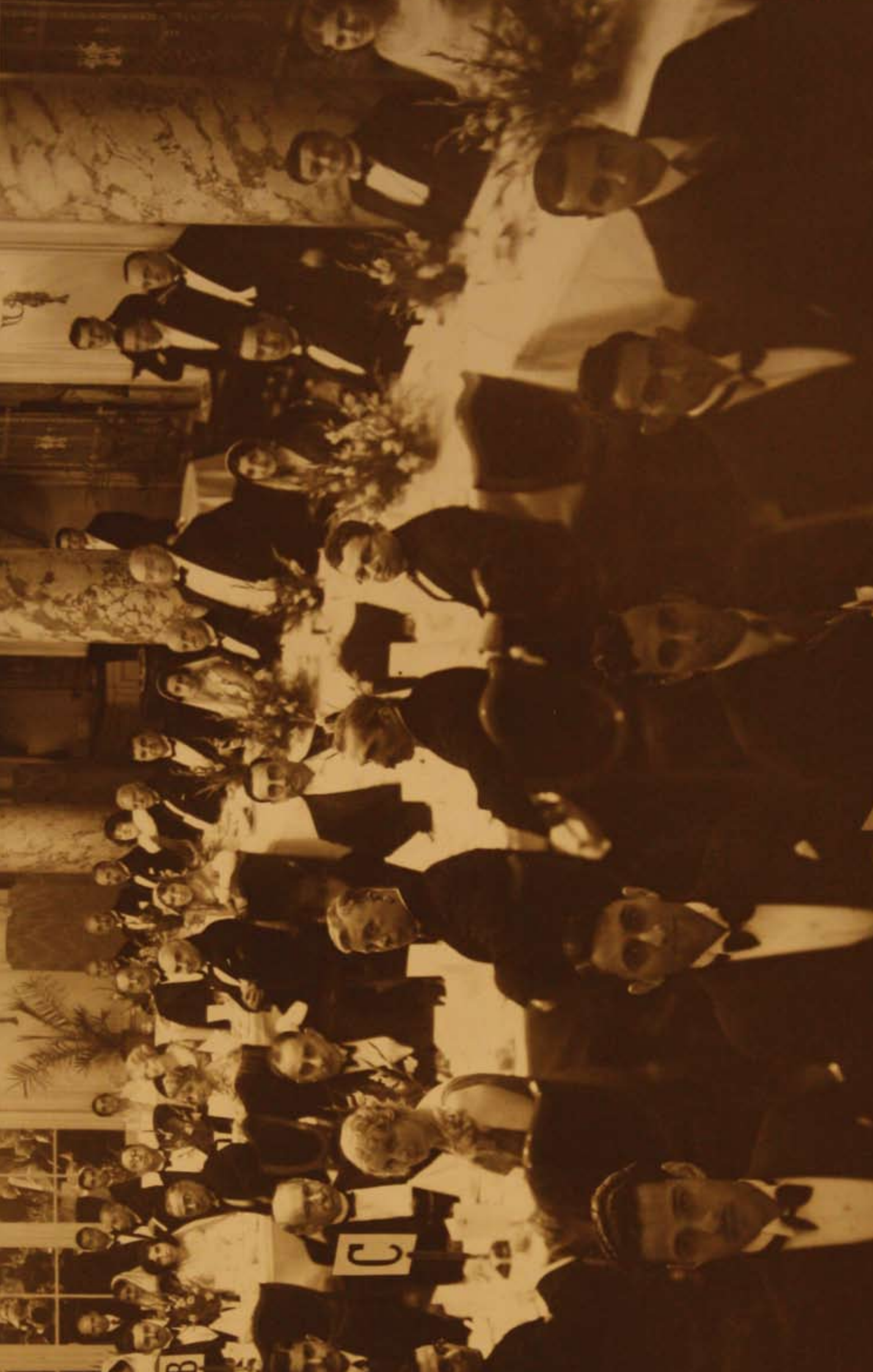
Pateti Banquet 1931 at the Waldorf Hotel, London