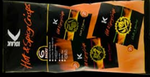
Kolak Hot & Spicy