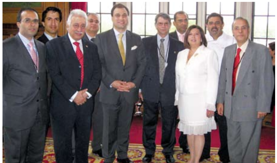
Members of the WZCC Committee

Many Zoroastrians have picked up prestigious and national awards for the contributions towards the economic growth in the United Kingdom. The Association inaugurated the UK Chapter of the Zoroastrian Chamber of Commerce under the Worldwide Zoroastrian initiative. The WZCC (UK) regularly organises business meets to promote Zoroastrian entrepreneur, businesses and professional establishments and encourage networking for mutual gain.