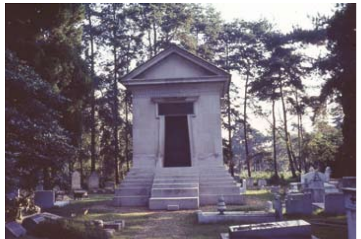
Wadia mausoleum at Brookwood Cemetery

earliest Patrons and founder of our Association.