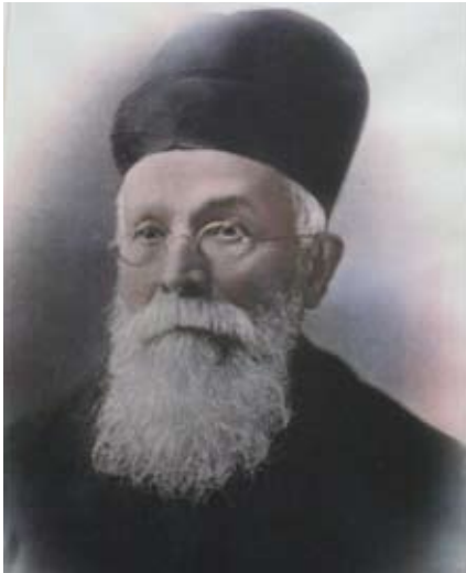
Dr Dadabhai Naoroji MP 1892-1895