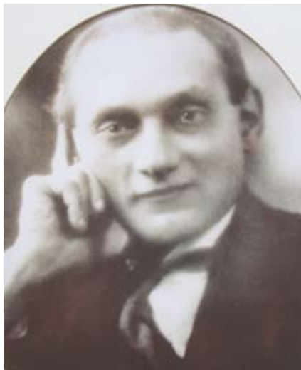
Shapurji Dorabji Saklatvala MP 1922 - 1929

Mancherjee Merwanjee Bhownagree KCIE was also the Association’s Third President from 1908 to 1933. The third Asian Member of Parliament was Shapurji D Saklatvala, elected to the House of Commons in 1922 to represent the constituency of North Battersea for the Labour Party, re-elected in 1924 for the Communist Party and remained a Member of Parliament till 1929. It is significant to note that the first three Asian MPs were all Zoroastrians but they belonged to different political parties.