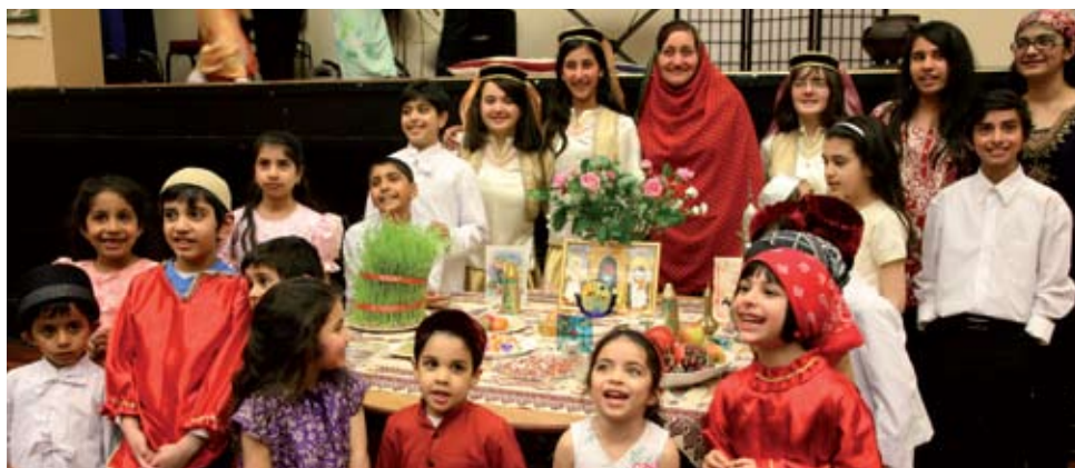
The XYZ's celebrating NoRuz with the Hafsina table

The Association ensures that religious education is imparted to the eXtra Young Zoroastrians (XYZ) through the Children's Educational Fun Club which conducts monthly religious classes