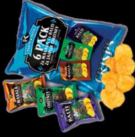
Kolak Taste of India