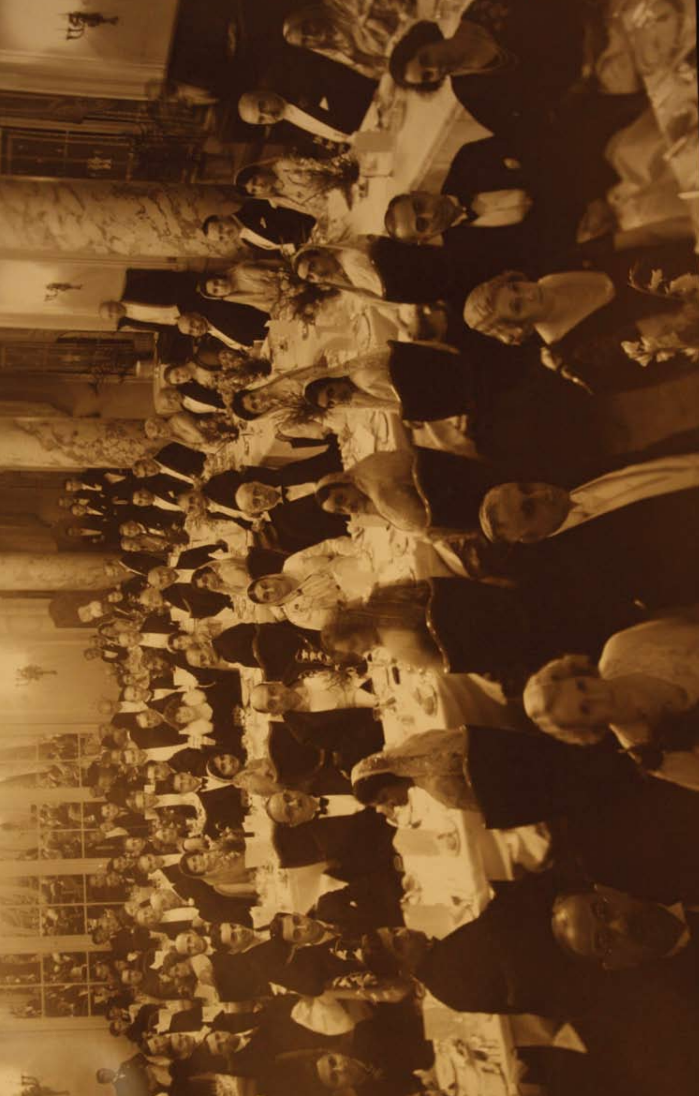
Pateti Banquet 1932, at the Waldorf Hotel, London.