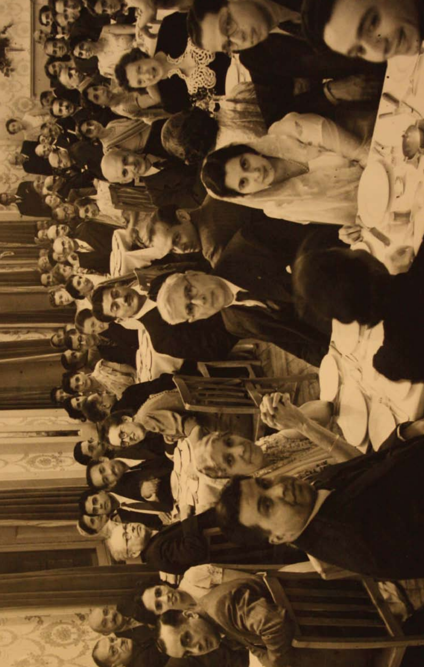
Pateti Banquet 1947, at the Chatelain Restaurant, London.