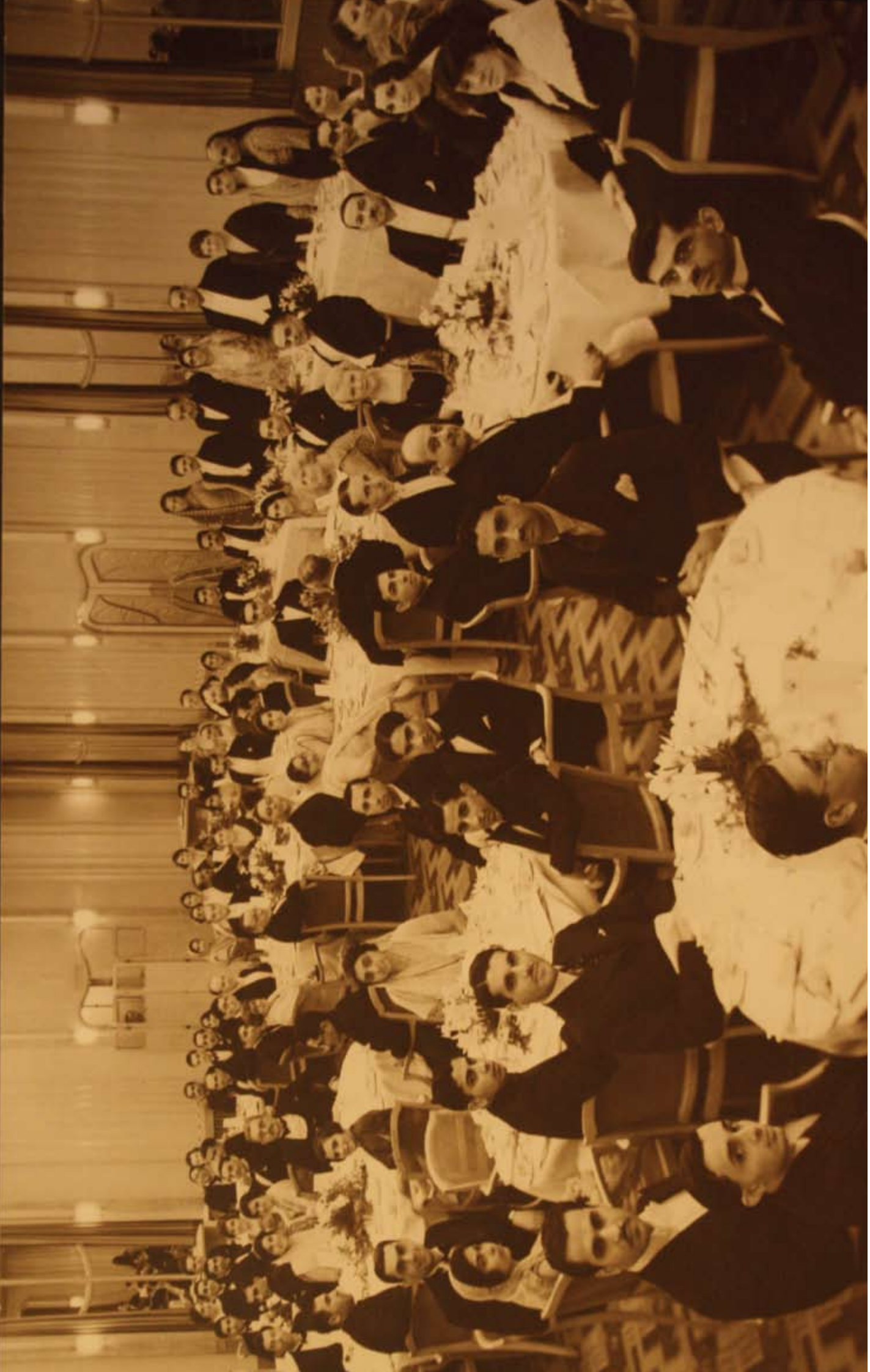
Jamshedji Navroze Banquet March 21st 1935, at the Trocadero Restaurant, London.