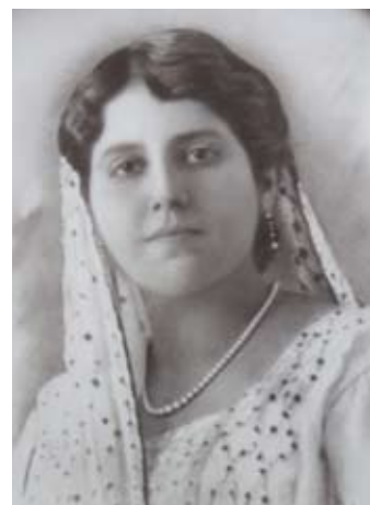
Sir Frainy Bomanji