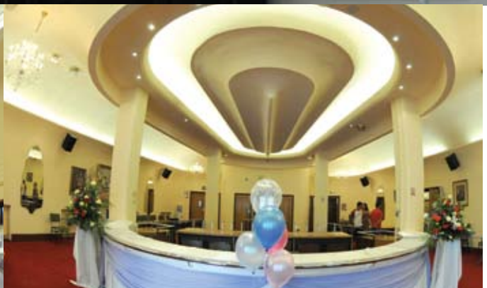
The Zoroastrian Centre at 440, Alexandra Avenue, Harrow HA2 9TL Purchased September 2000