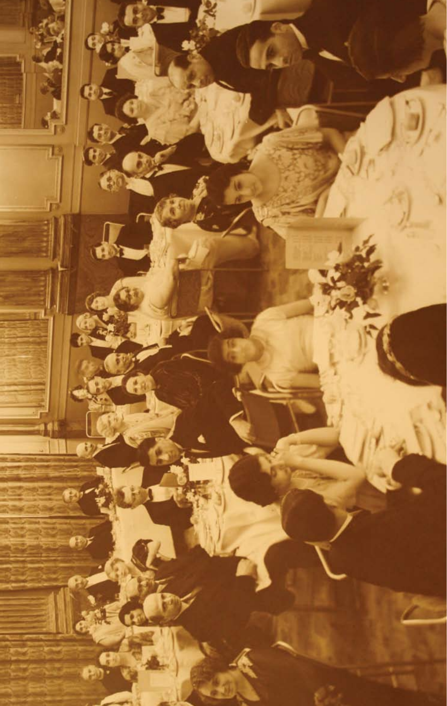
Jamshedji Navroze Banquet 1937, at the Criterion Restaurant, London.