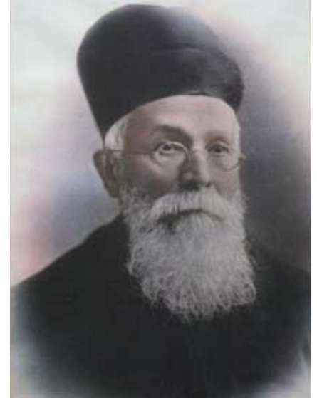
Dr Dadabhai Naoroji