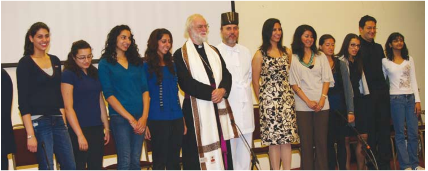
The Young Zoroastrians with the Archbishop of Canterbury during his visit to the Zoroastrian Centre in 2010

was honoured by a landmark and historic visit to the Zoroastrian Centre on 1st October 2010 by the Most Reverend and Right Honourable Dr Rowan Williams, Lord Archbishop of Canterbury accompanied by officials from the Lambeth Palace. It was the first ever official visit by the Archbishop of Canterbury and Head of the Worldwide Anglican Communion to a Zoroastrian place of worship in the history of our two religions – Zoroastrianism and Christianity. His Grace the Lord Archbishop's visit and his address to our members were memorable.