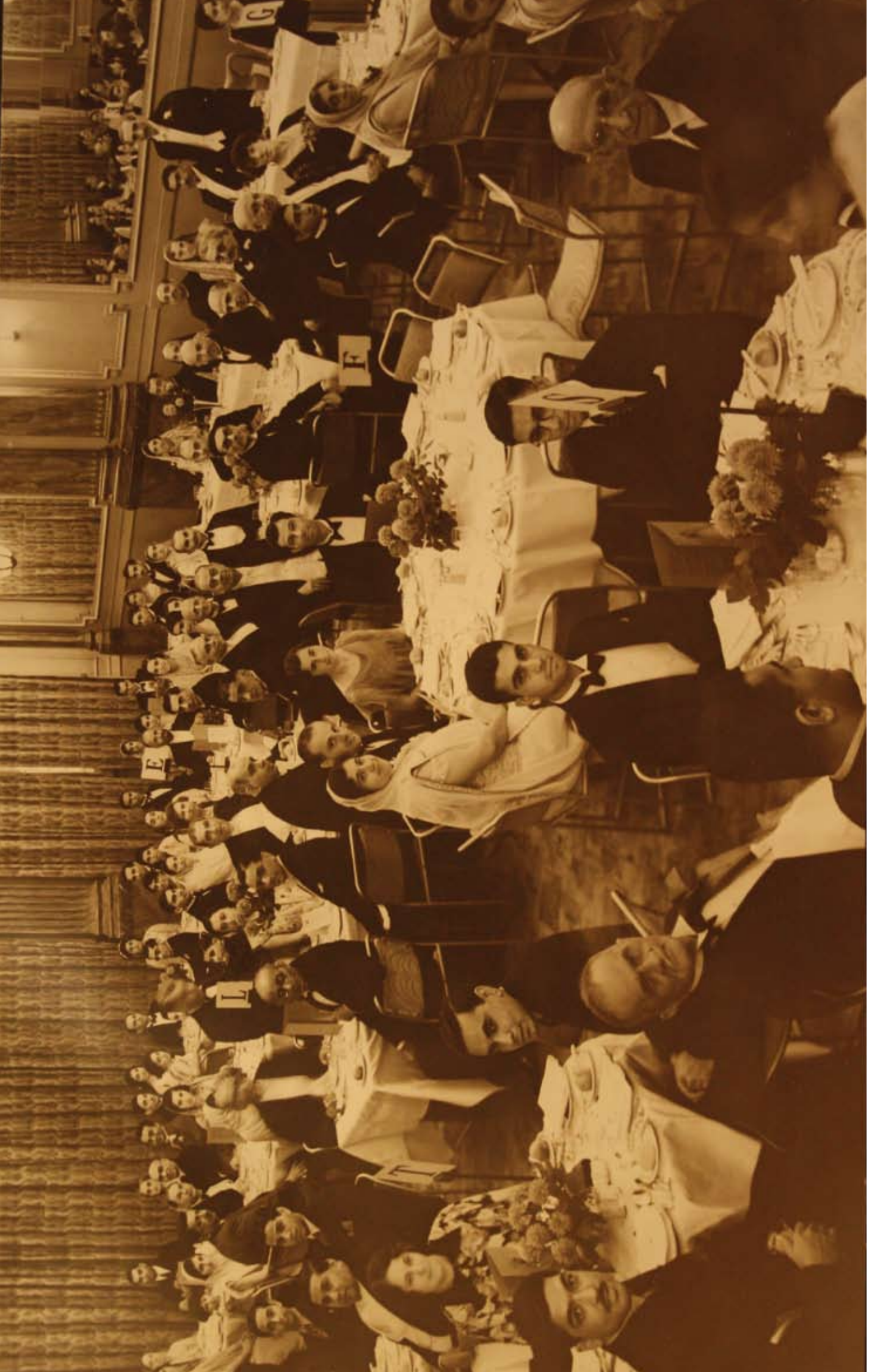
Pateti Banquet 1936, at the Criterion Restaurant, London.