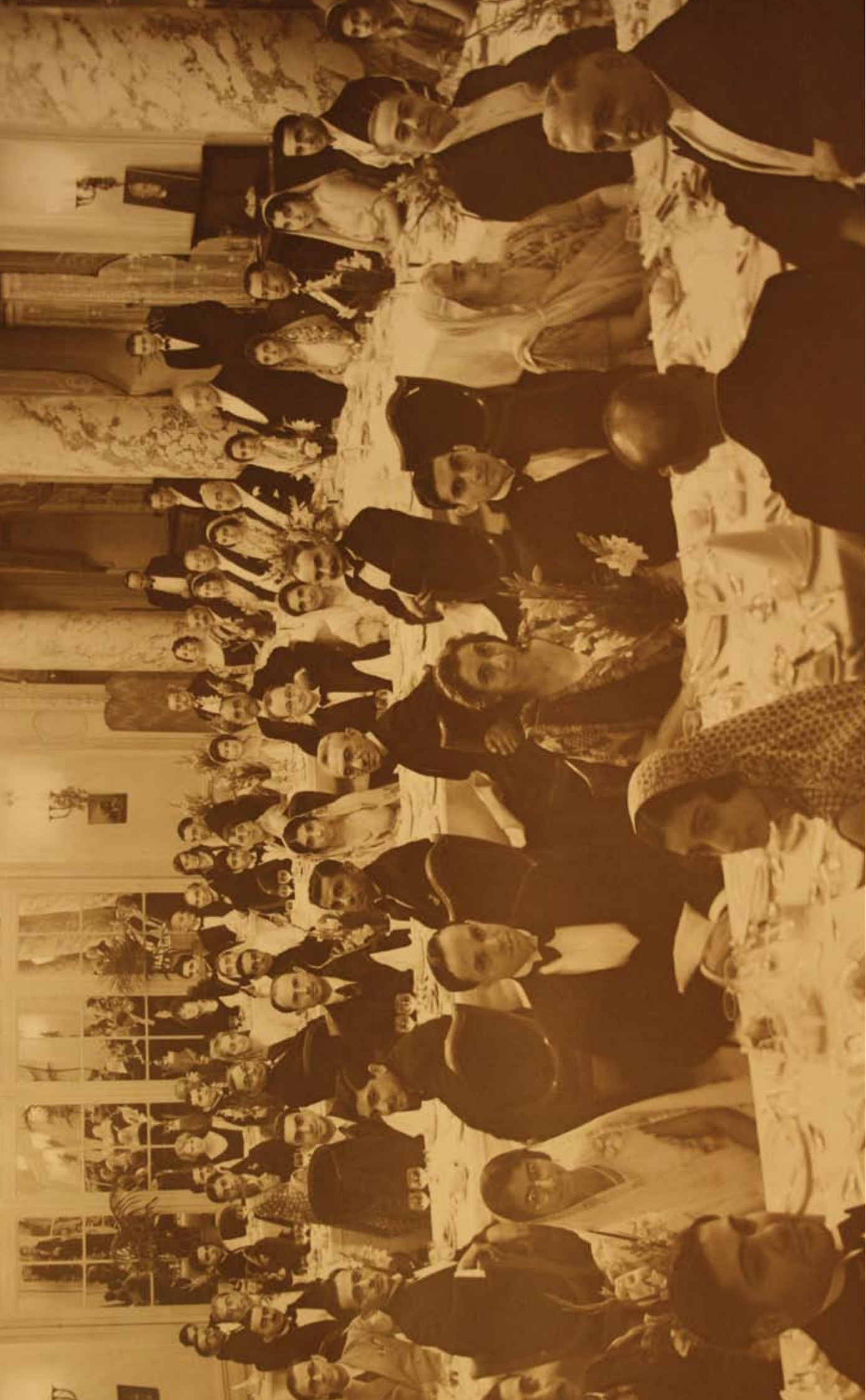
Pateti Banquet 1933, at the Waldorf Hotel, London.